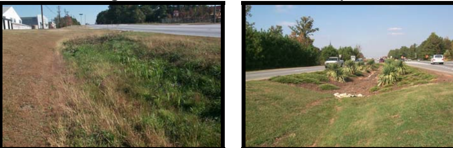
Figure 4-39. Enhanced Swale Examples

There are two primary enhanced swale designs, the dry swale and the wet swale (or wetland channel ). Figure 4-39 depicts both types of enhanced swales.